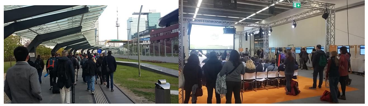
Scientists joining the EGU General Assembly at the Austria Congress Centre in Vienna and a PICO Session, a new interactive concept for poster sessions.