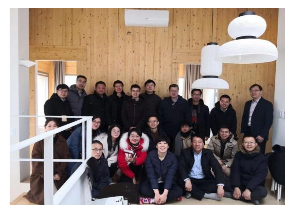
Part of participants from the 14th Joint Seminar of China-Japan-Korea visiting the construction of a timber structure located in Seoul city.

On December 4-7, 2019, the Fourteenth Joint Seminar of China-Japan-Korea on Wood Quality and Utilization of Domestic Species (14th CKJ Seminar) was held at Seoul, organized by the National Institute of Forest Science (NIFoS), Republic of Korea. More than 80 scholars from totally 16 universities and research institutions gathered to discuss the frontier questions of wood quality and utilization. During the joint seminar, 3 keynote lectures and 19 oral presentations with 26 posters were presented. The Joint Seminar of China-Japan-Korea on Wood Quality and Utilization of Domestic Species was launched by wood science and technology experts from China, Japan and Korea since 2006. The aim of this joint seminar is to promote international experts and scholars to exchange the latest research results, advanced technology and experience in wood science fields, and discuss the opportunities and challenges of wood properties, wood products and utilization in China, Japan and Korea.