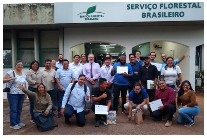
Group photo of course participants from eight South and Central American countries