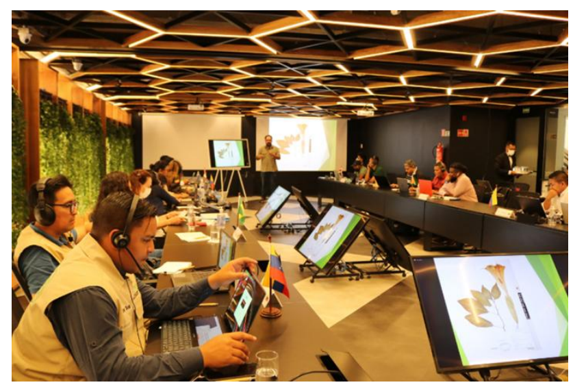
Lecture on wood anatomical identification given at the headquarters of the Amazon Cooperation Treaty Organization (ACTO)